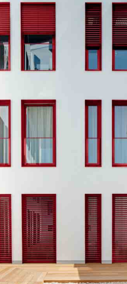
Creative freedom in external and internal design with Schüco AutomotiveFinish.