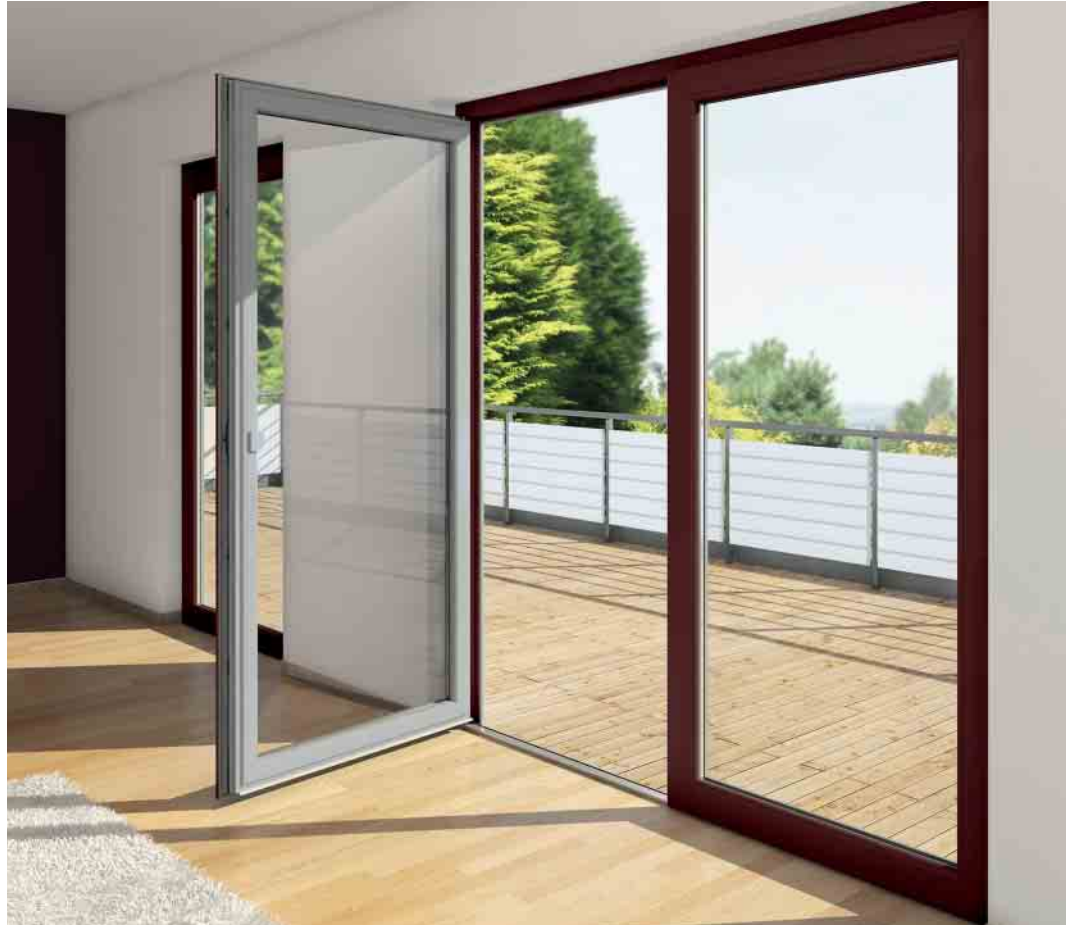
Schüco AutomotiveFinish allows new design effects to be combined with easily accessible, attractively priced services.